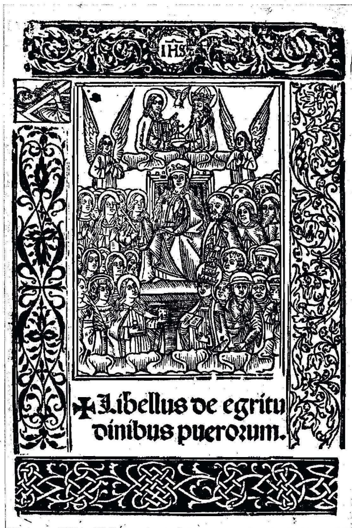
Fig. 4. Paulus Bagellardus, Libellus de egritudinibus puerorum . [Lyons c:a 1505?]

this disease were Joseph Grünpeck (1496 and later) and Nicolaus Leonicensus (1497), whose works were mentioned earlier in the discussion on incunabula. Wendelin Hock de Brackenaus, a physician working in Bologna, published in 1502 a work on syphilis, "Mentagra", in which he recommended mercury as a cure. Waller owns the Strassburg edition of 1514 of this rare work. The German humanist Ulrich von Hutten, a man well-known in other fields, contracted the disease and published in 1519 a